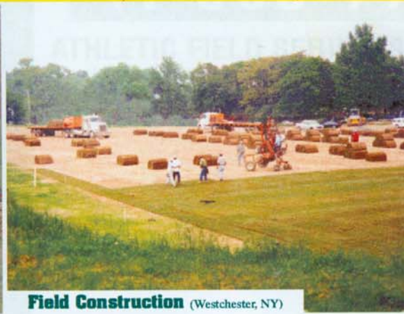
Field Construction (Westchester, NY)