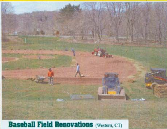
Baseball Field Renovations (Western, CT)