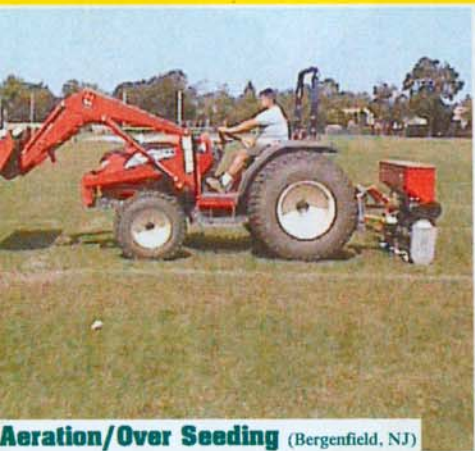
Aeration/Over Seeding (Bergenfield, NJ)